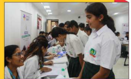
KITE-TASTIC, THE WINTER CARNIVAL